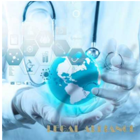
The Parliament Has Adopted the Healthcare Reform