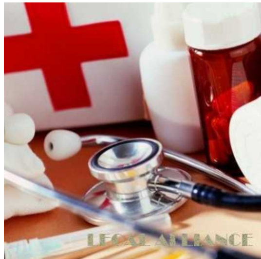
Changes in the Procedure for Selecting Drugs to the National List Approved