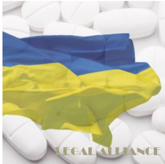
Introduction of Medical Reform