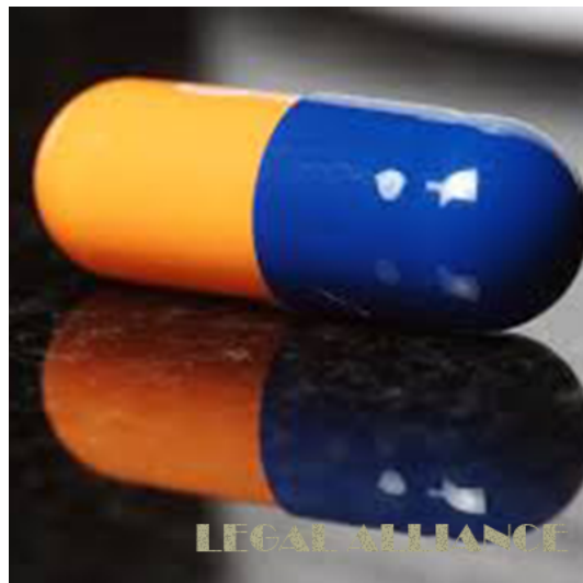
New Register of Maximum Wholesale Prices for Medicines to Participate in the Government Program "Available Medicines" adopted.