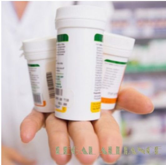
Changes to the Procedure for Realising Preferential Drugs Adopted