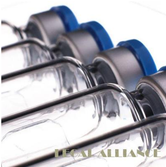
A New Edition of the National List Approved