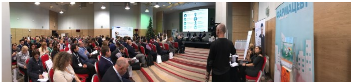
Legal Alliance Company Held the Conference "Healthcare And Pharmaceuticals - 2018. Anticipations And Expectations"