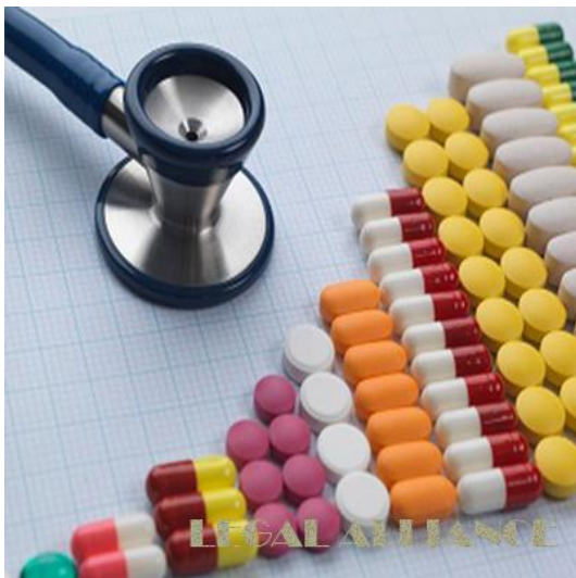
Amendments to the List of Medicines and Medical Products Purchased by International Organizations Adopted