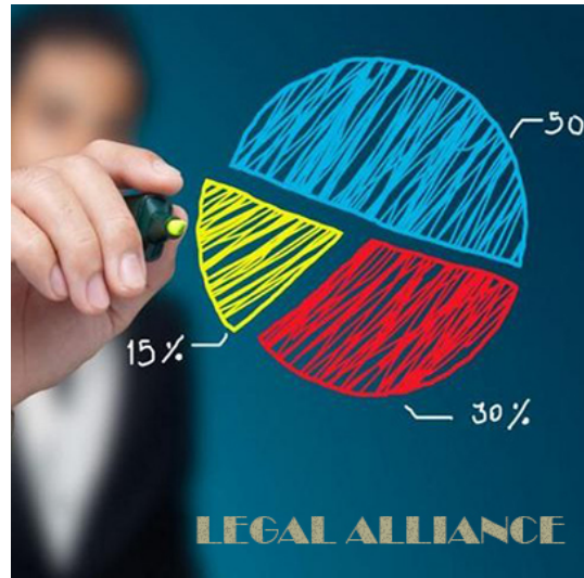
The Antimonopoly Committee of Ukraine Has Published the Project of the Methodology for Determining the Markets