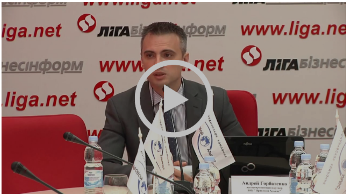
Round Table "The Future of Distribution Contracts in the Pharmaceutical Market: Is the Harbor Safe?"

Pharma Market: When the Mist Clears Away